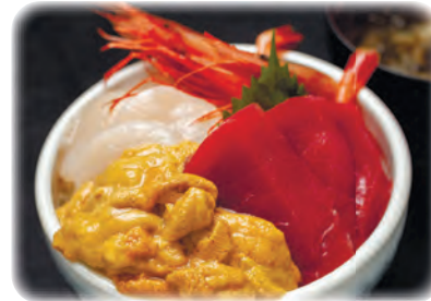
Seafood rice bowl

Seafood rice bowl is one of the most popular dishes in Hakodate. Eateries specializing in this favorite local dish are located en masse at the morning market located in front of Hakodate Station.