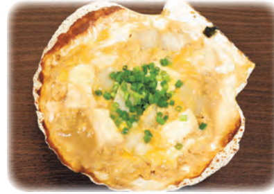
Grilled Scallop with Miso

A traditional local dish where a large scallop shell is heated, and dashi broth, miso, green onions, scallops, and eggs are added. It was once a special dish made to provide nutrition.