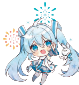
Hakodate Christmas Fantasy

This is annually held from December 1 to 25, is an iconic winter event in Hakodate. An immense Christmas tree is floating in the bay fronting the Kanemori Red Brick Warehouse, with fireworks every day at 18:00. Soup bars will also be out on the sidewalks of Hakodate Bay.